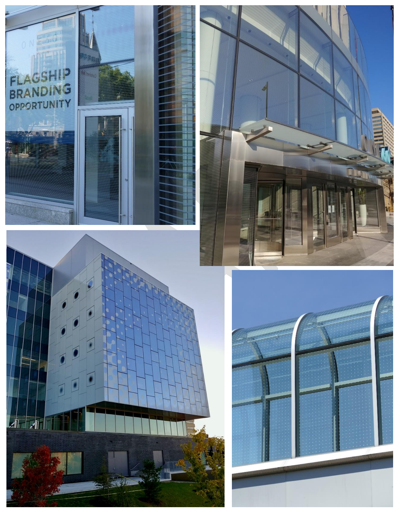
Figure 7: Local examples of bird-safe glass at 160 Elgin (top), uOttawa (bottom left) and Ottawa City Hall (bottom right).