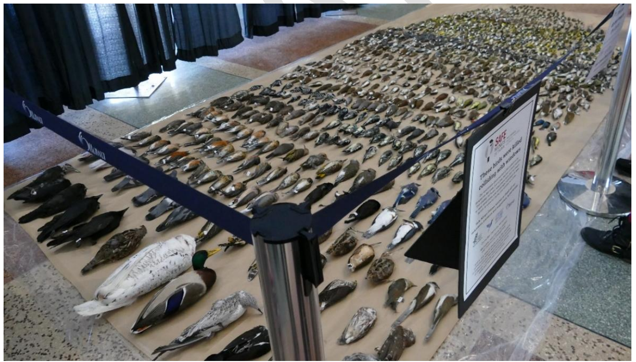
Figure 1: Display of birds killed by collisions with buildings in Ottawa, collected by Safe Wings volunteers in 2017. While most victims of collisions are songbirds, even large birds such as ducks, hawks and owls are vulnerable.

The Bird Friendly Building Program was initially developed by the World Wildlife Fund Canada and Fatal Light Awareness Program (FLAP) Canada in 1995, to address bird collisions with lit buildings at night. Since then, the term "bird-friendly" has grown to include a wide variety of mitigation measures aimed at reducing risks to birds in the built environment. The term "bird-safe" is increasingly being used to more clearly identify design features and other factors that have been scientifically proven to avoid or reduce risks to birds. Other design features, including some which are intended to attract birds, may still be considered "bird-friendly," provided that they do not increase risks to birds. The primary focus of these guidelines is on bird safety.