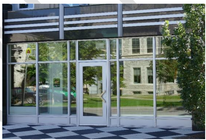
Figure 5: Glass reflecting landscaping and buildings across the street.

The following guidelines are strongly recommended for all projects involving glazing, to reduce risks to birds: