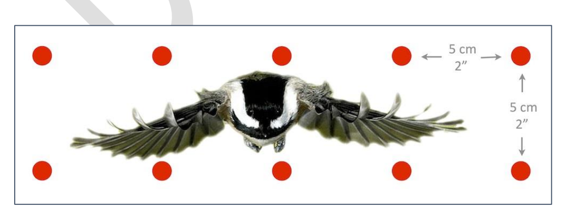
Figure 6: The spacing of markers is representative of the area occupied by a flying songbird, the most numerous victims of collisions.

Treatments applied to interior surfaces of the glass will not adequately address reflectivity issues. They will also be less effective at reducing transparency issues if reflectivity is not addressed.