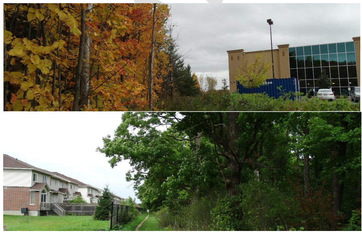
Figure 2: Examples of development adjacent to natural areas.

The siting of buildings in relation to the surrounding environment is always a key consideration in building design, and becomes particularly important in bird-safe design. Generally, buildings located adjacent to forests, parks, waterfront areas and wetlands (see Figure 2 below) are likely to have an increased probability of bird collisions. While many of the City's most sensitive natural areas are largely protected from development, our abundance of greenspaces and waterways means that it is not possible to entirely avoid building near attractants. Indeed, many of these features are also highly attractive to people and contribute to the liveability of our city.