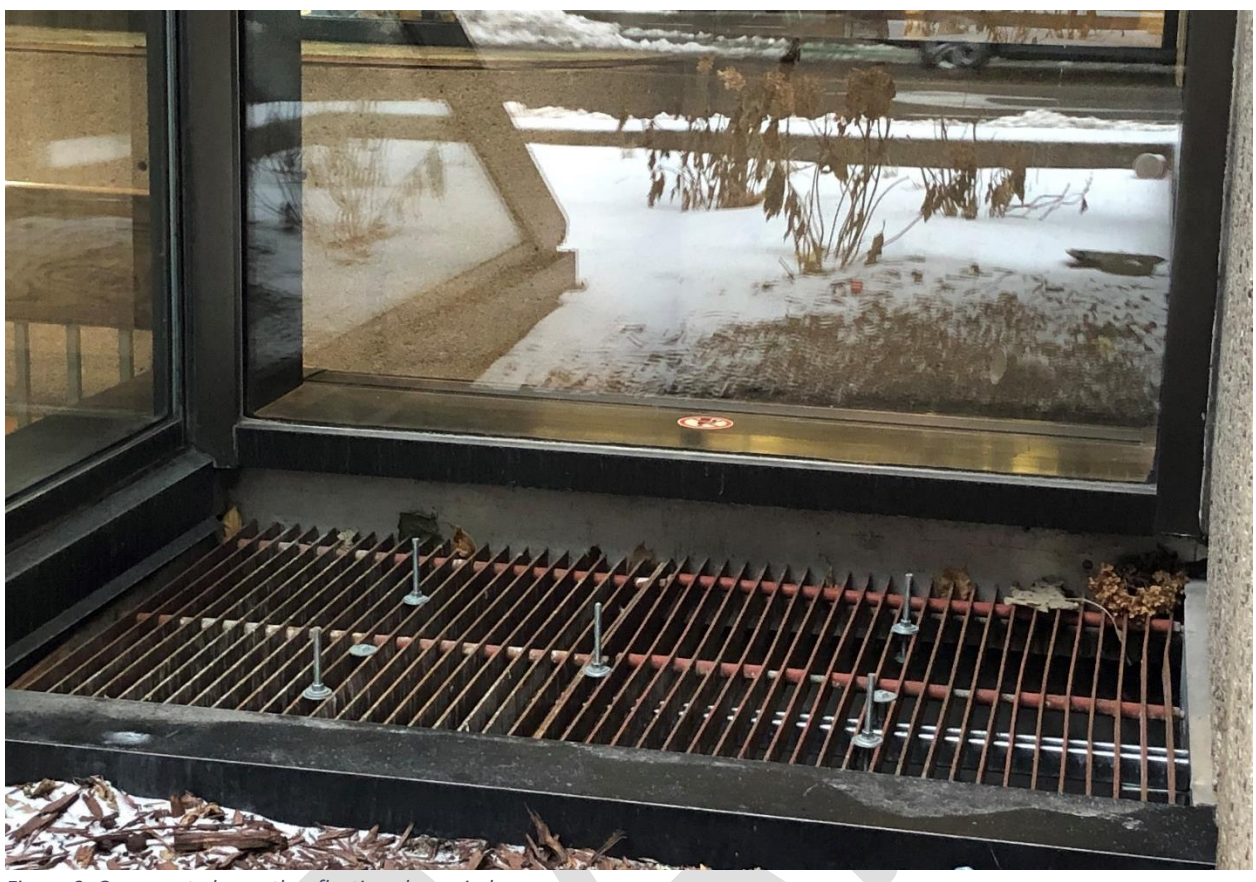
Figure 9: Open grate beneath reflective glass windows.