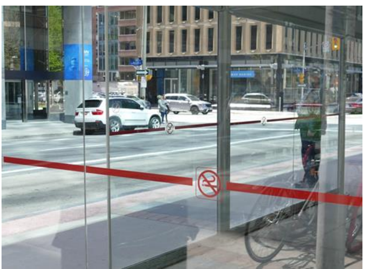
Figure 4: Transparent glass transit shelter.

Reflectivity : Birds also strike reflective panes while attempting to reach areas of sky or habitat mirrored in the surface. This can occur when light reflects off any type of glass or other highly polished surface, not just on mirrored or tinted glass. The birds perceive only the reflected image, rather than the hard surface itself. Reflections of shrubs and trees cause more collisions than reflected pavement or grass.