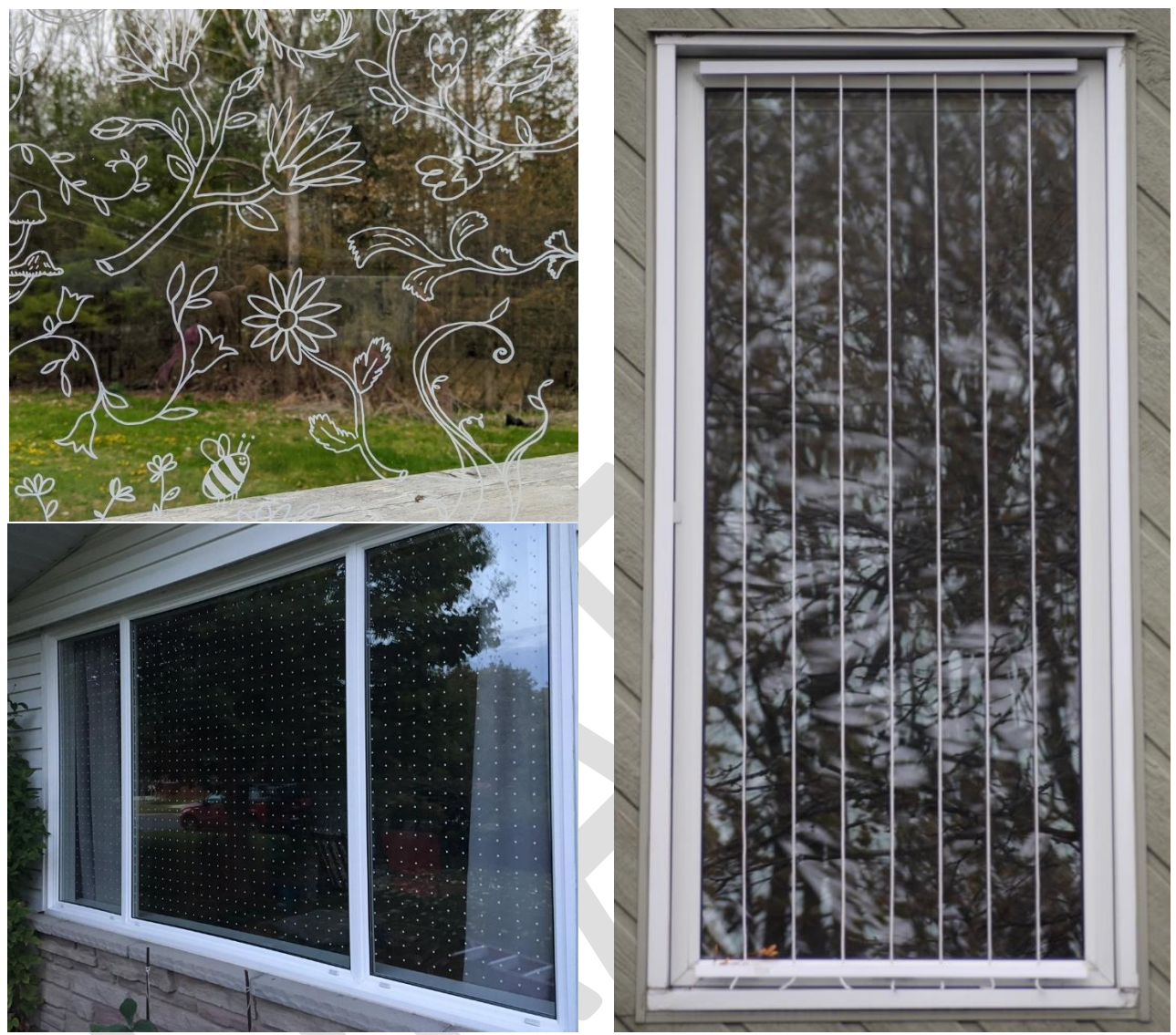
Figure 11: Examples of window treatments (oil-based paint marker mural top left, Feather Friendly DIY tape bottom left, Acopian BirdSaver on right).