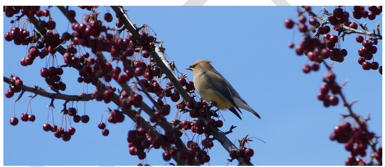
Figure 10: Cedar waxwings and other songbirds are often attracted to flowering crabapples and other trees that retain their fruit over winter. Entire flocks of waxwings may be injured or killed in collisions with nearby buildings.